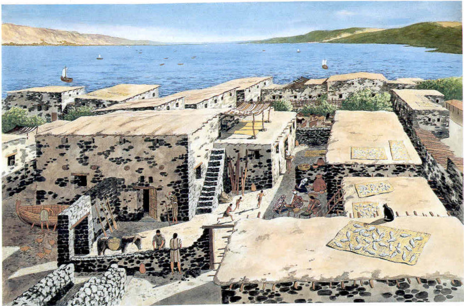
Reconstruction of a First-Century Courtyard House at Capernaum